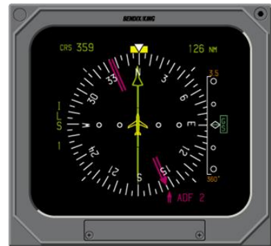
EADI/EHSI and EHI 40/50 EHSI