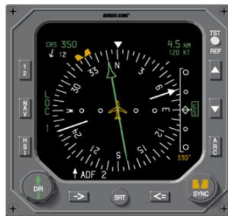
BendixKing EFS 40/50