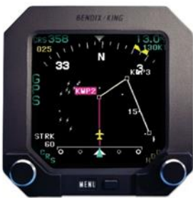
Bendix/King KI 825